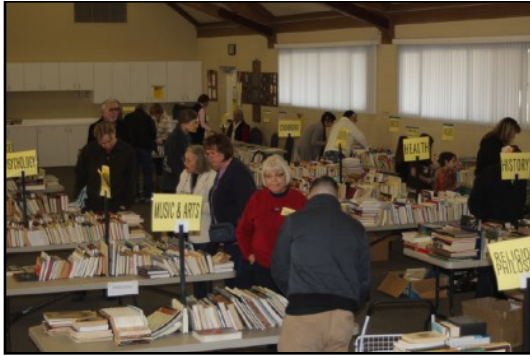
Friday morning at our book sale