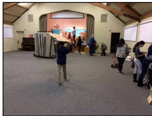
Saturday afternoon clean-up