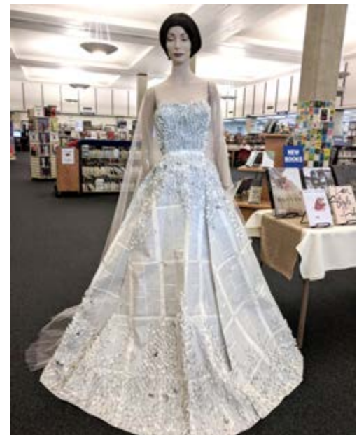
Graceful wedding dress fashioned from recycled encyclopedias.