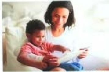
The project was made possible in part by the Institute of Museum & Library Services