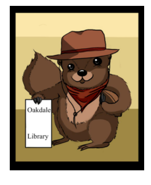
Oakdale Library's Dusty the Squirrel –Emily Slusher